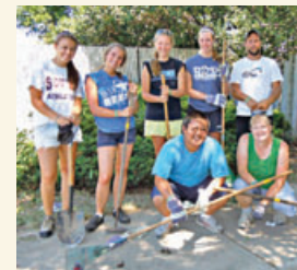
Group doing yard work at SSH.

Serve London is a group of youth from across North America who spend a week of their vacation time serving London community organizations in a variety of activities. Women's Community House has had the fortune of being a part of the Serve London project for 3 years now. These energetic young people have worked at 3 of our sites doing yard work, cleaning, painting and providing recreational activities for the children. We are truly grateful to these young people for their service to us.