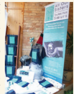
All Our Sisters Display

It was at about this time that a small community of women in London began to talk about bringing women together from across the country to develop action plans for housing and safe communities for women; to hear of successful gender-specific, diverse solutions; participate in creative action-oriented workshops and to foster collaboration between women with lived experience, service providers, researchers and activists. After 3 years of solid work, the Forum came to fruition with over 500 participants from across the country. Women's Community House played a significant role in making this event happen.